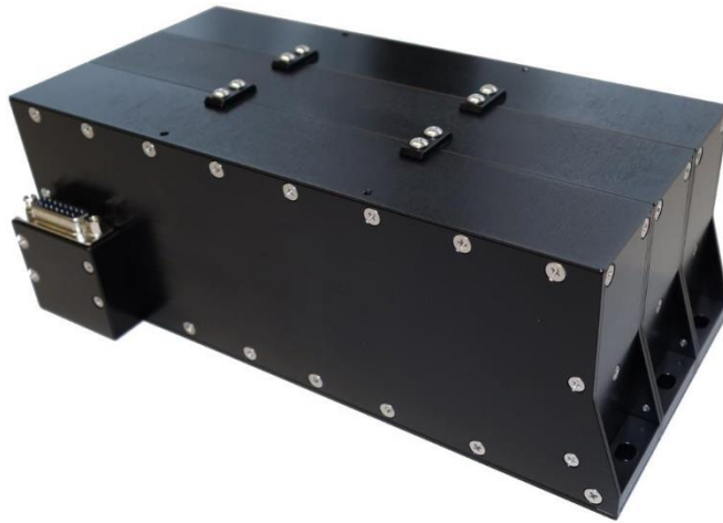
BST Li-Fe Battery System

The BST BAT-110 is a modular battery system for small satellites. It is based on Lithium-Ferrite (Li-Fe) cells. The BST's Li-Fe battery technology offers 10x more cycle over Li-Io or Li-Po batteries and is significantly less hazardous. The battery block is protected for over charging (non-destructive), tolerant against deep discharge (non-destructive) and offers cell balancing. It has a design life of 5 years lifetime in LEO and its direct predecessor is space proven.